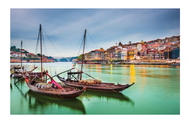
Porto Pre-Tour Extension -A Luxury Small Group Journey (2025)