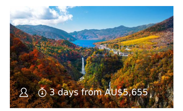
Nikko Pre Tour Extension -A Luxury Small Group Journey (2025) See Details