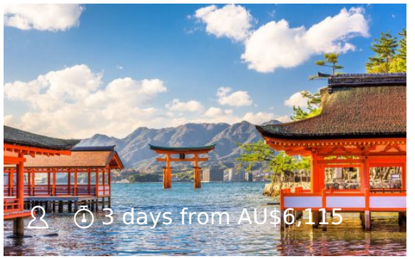
Hiroshima Post Tour Extension - A Luxury Small Group Journey (2025) See Details