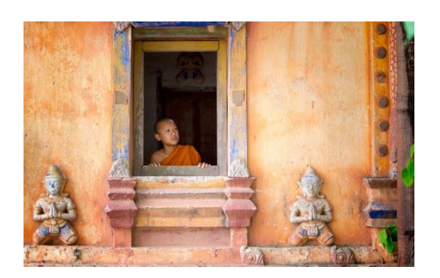
Luang Prabang Pre Tour Extension - A Luxury Small Group Journey (2024)